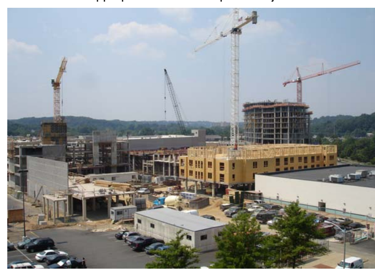
Concrete to Stick Built and so much in-between

Miller Mechanical Contractors & Engineers is involved in more parts of the construction process than any of the other subcontractors on our projects. From the initial work with the concrete sub and utility company for underground plumbing, through the framing process for our rough in, and the last stages of fixture and punch, we know that we have an opportunity to set the pace for the job. We work not just to keep up, but when appropriate we want to push the job forward.